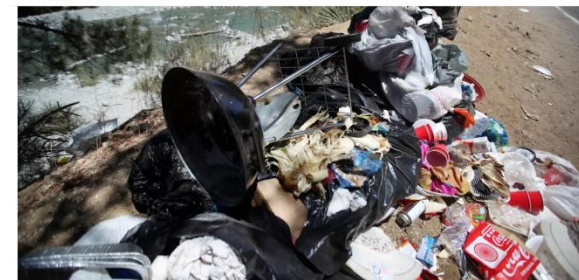
Trash piles up even in Southern California's wilderness backdrop, the San Gabriel Mountains National Monument in the Angeles National Forest.