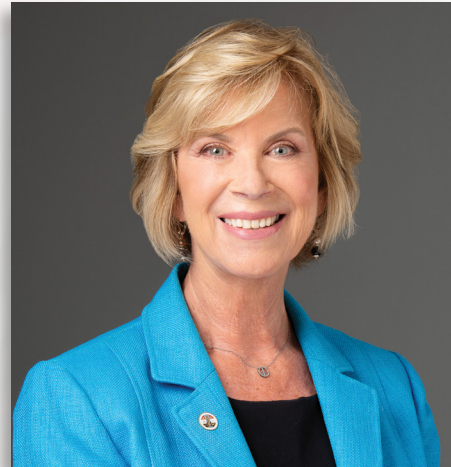
Los Angeles County Supervisor JANICE HAHN

FRIDAY, OCTOBER 15, 12 NOON - 1:30 PM PST