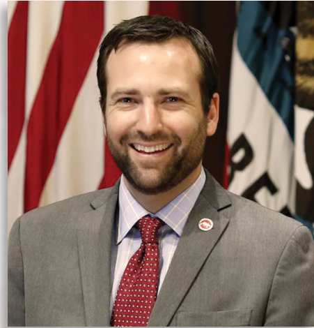
Senator BEN ALLEN