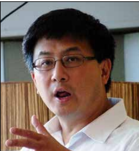
State Controller John Chiang opposes everything Democrats stand for, from Roe v. Wade to environmental regulations.