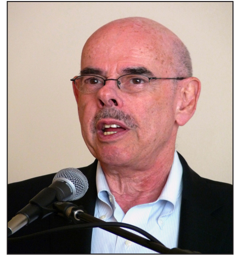
Congressman Henry Waxman

Congressman Henry Waxman discussed his views and his work in Congress on climate