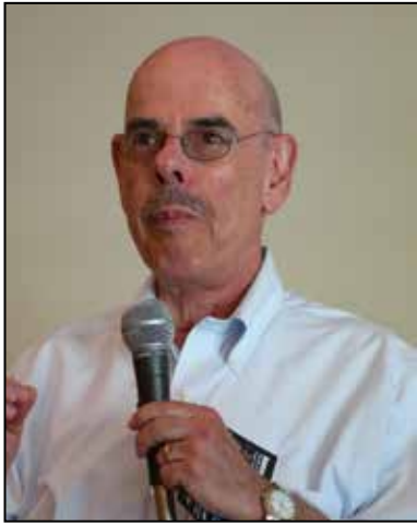
Rep. Henry Waxman - Democrat for Congress 33rd District