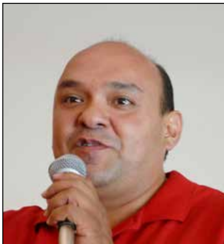
Sergio Carrillo, regional chair of California Democratic Party

For state propositions: Yes on 30, 34, 35, 36, 37, 40; No on 31, 32, 33, 38; Neutral on 39.