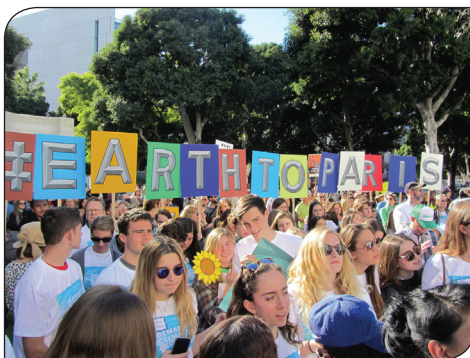
Pre-Paris Global Climate March event at LA City Hall

For the United States it is a huge embarrassment that the Republican party continues to deny that man made global warming exists. The fossil fuel industry gets its reward for their generous campaign contributions. Despite the US pledges in Paris, it is a foregone conclusion that the Republican-controlled Congress will do everything it can to stop progress. The Republican presidential candidates follow the party line. The Democratic candidates