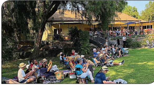
The beautiful grounds at St. Luke's Presbyterian Church for the PV Democrats Picnic and Installation Party

District, has more voters registered as Democrats than Republicans. They emphasized how much harder it will make accomplishing any progressive actions with