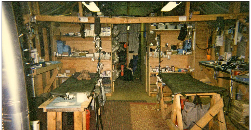
Afghan Field Hospital