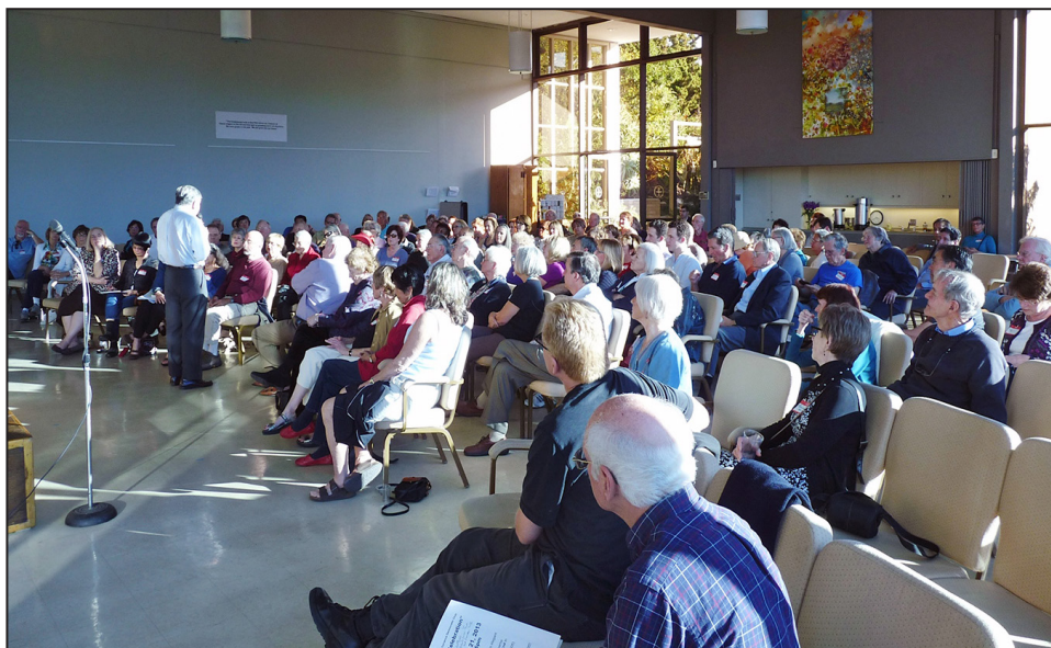
Governor Dukakis spoke at the January meeting

The lesson here is that precinct-based grassroots organizing works. It is a strategy that Democrats failed to do well in the