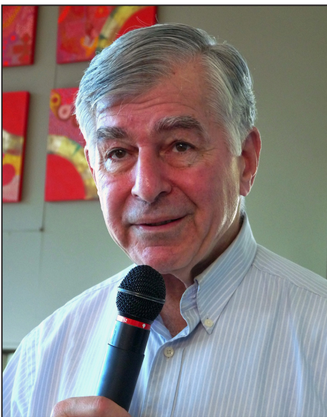
Governor Michael Dukakis

past. In the 2012 election, it made a huge difference. It was this kind of house-to-house, person-to-person campaign that helped Obama win all the battleground states except North Carolina and helped Elizabeth Warren win the Senate seat in Massachusetts.