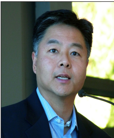
State Senator Ted Lieu

built to help the president push some important legislation through Congress.