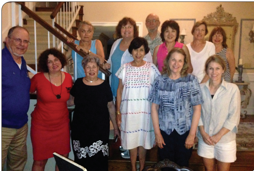
2014-2015 Palos Verdes Democrats Board: