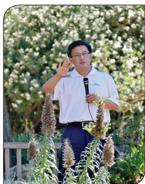
John Chiang, CA State Treasurer

likely will be legislated during the next term. It is only a few months until the election, so each of us must help out as much as we can in this short amount of time to insure Democratic victory in November.