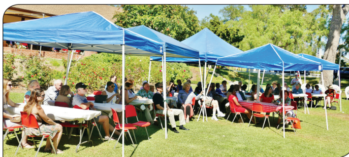
Picnic in the St Luke's Garden

The overarching theme voiced by our speakers is the absolute necessity to elect a Democrat to the White House. Our Supreme Court and down ticket offices are totally at stake, and there are huge differences between the parties. Environmental protection, gun safety, women's rights, campaign financing, social and financial inequality and trade policies are just some of the extremely important issues that