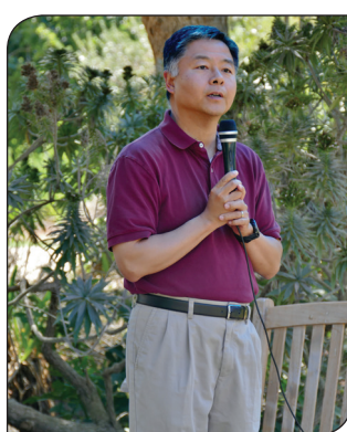
Ted Lieu, Congressman 33rd CA Congressional District