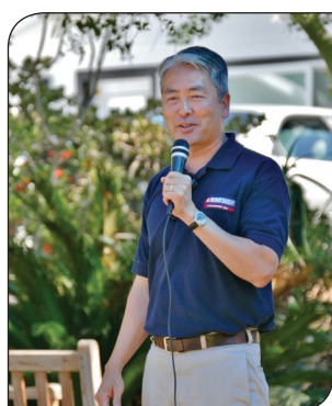
Al Muratsuchi, Candidate for CA 66th Assembly