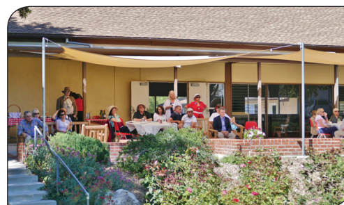
St Luke's food buffet