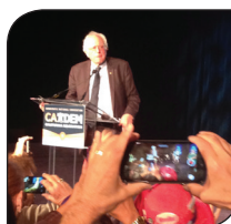
Sen. Bernie Sanders

Each morning the California delegation has a breakfast in the ballroom of the delegation hotel. Anyone can buy a ticket and attend these. They start at 8:00 am. It's the place to hear short speeches from visiting politicians, both from California and around the country. I attended on Tuesday morning only and heard Sen. Amy Klobuchar, Sen. Al Franken, Sen.