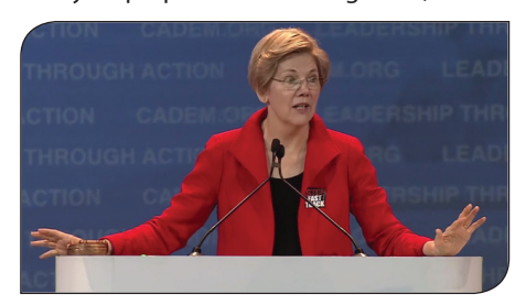
Senator Elizabeth Warren (D-MA)

On Saturday, May 16, Senator Elizabeth Warren (D-MA) spoke at the California Democratic Convention, and she came out swinging! She called on all of us Democrats to roll up our sleeves and fight—fight to protect middle and working class families from the greed and abuse of large corporations and big banks. She called for a raise in the minimum wage, paid leave, support for organized labor, a stop to the fast track of the TPP, and more. But, what was so amazing about Warren's speech wasn't just her ability to pinpoint what to fight for, but also