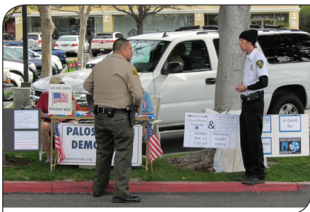
Security Guards contesting Palos Verdes Democrats tabling at Farmer's Market

told we could only set up in a hardly trafficked area located behind the Farmer's Market, we could have only 2 signs, our signs could only be of a smaller size, had to be attached to our table, and all posted information had to be approved by the management company at least 3 days in advance. We felt this infringed upon rights stipulated by the Pruneyard decision, which established that even on private property in areas where the public gathered such as farmer's markets, specific free speech rights prevailed. The City Attorney of Rolling Hills Estates was contacted, and from the information we gave him, he felt we had a right to be there. Feeling that the security guard was simply overzealous, the PV Democrats, Occupy PV and others ignored the management brouhaha and continued to set up in our usual spots without incident....until March 15 of 2015. That is the first time that same security guard was again on duty, and he again told us we had to leave. Despite showing him the e-mail from the City Attorney, he called the Sheriff. After 3 squad cars showed up and spoke with everyone, it was agreed that we could stay but had to contact the market management. Hans Grellmann did