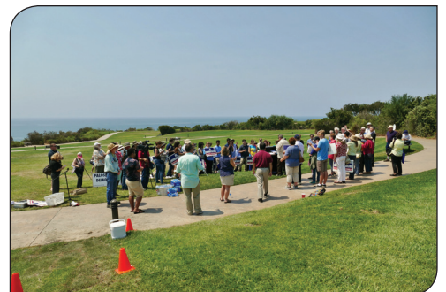
Rally at Founders Park overlooking the ocean