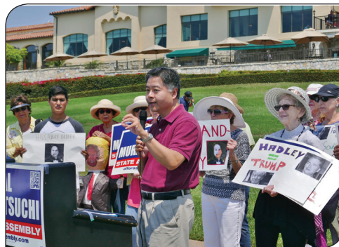
Ted Lieu, Congressman 33rd CA Congressional District

Congressman Ted Lieu mentioned that to launch a nuclear weapon, only the President